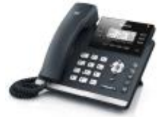
Yealink T4 series